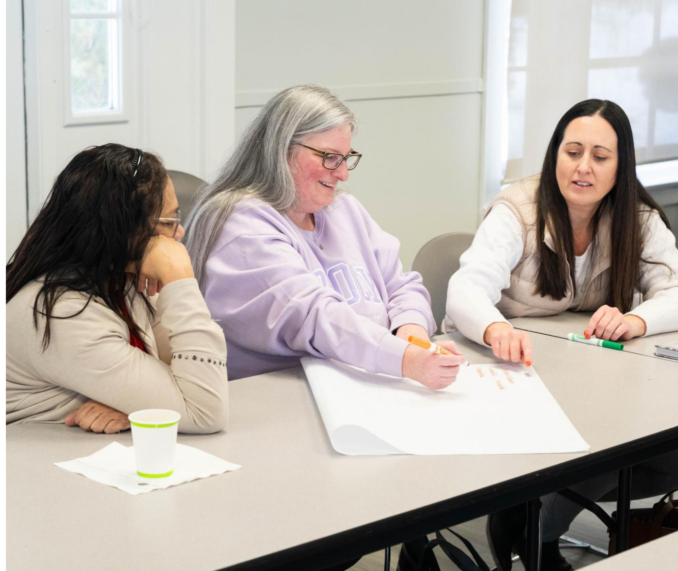
Pictured: Representatives from Brock University's Faculty of Education participating in a focus group at the Niagara Parks School of Horticulture.