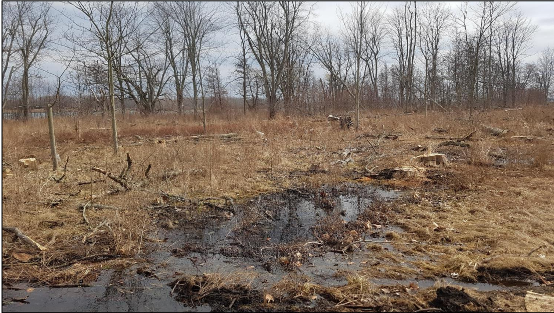
Figure 1: Gonder's Flats Prior to Restoration