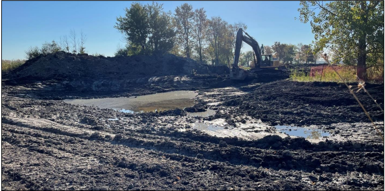
Figure 3: Gonder's Flats Wetland Construction