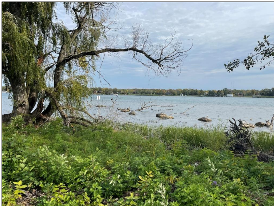
Figure 2: Gonder's Flats Coastal Wetland – Installed 2018