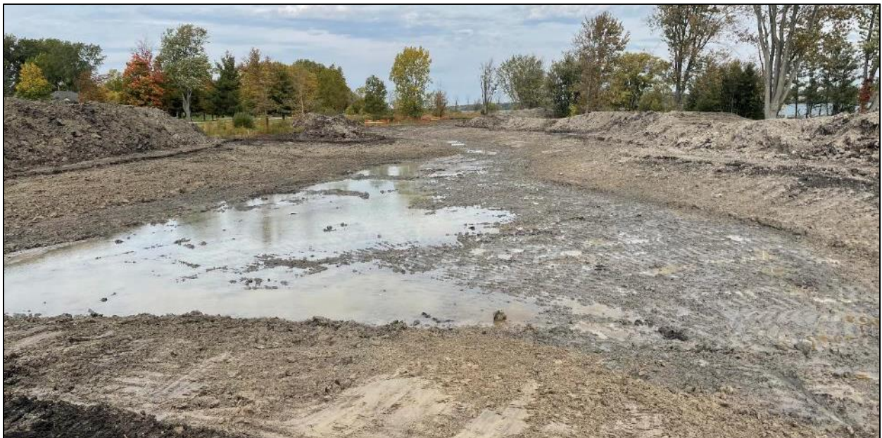
Figure 4: Pond excavation complete