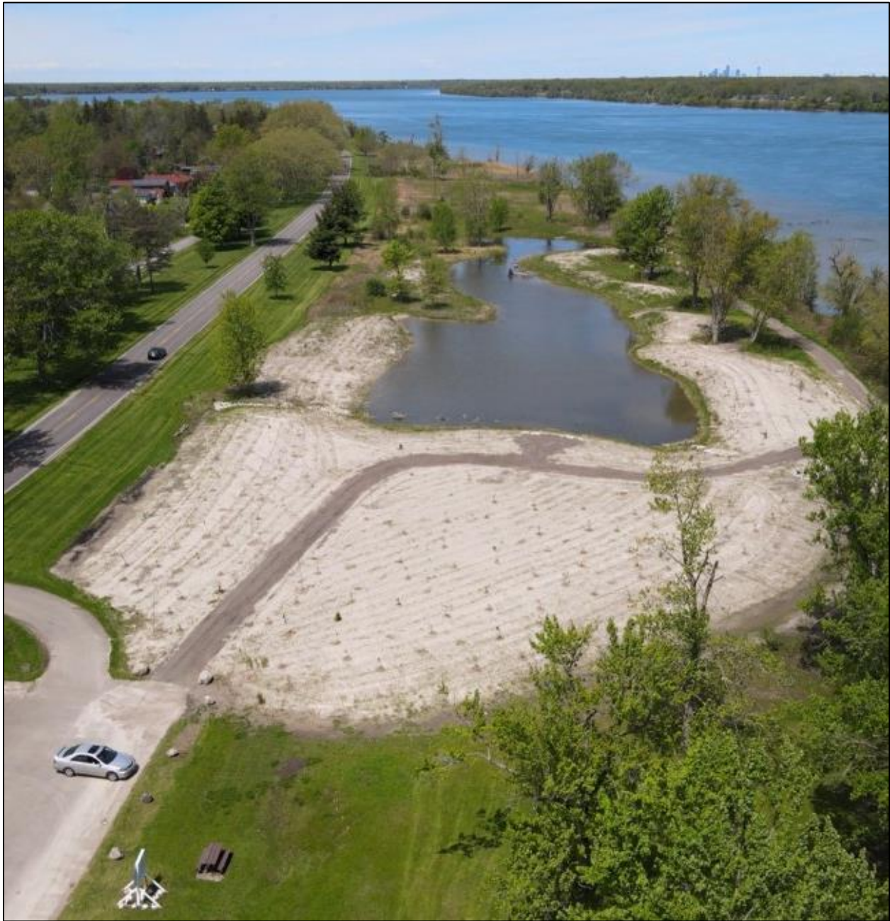
Figure 6 – Aerial View of Gonder's Flats – Spring 2024