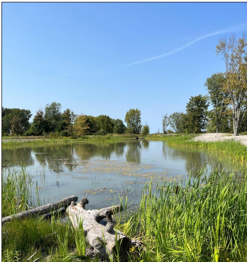
Figure 5 - Gonder's Flats – Fall 2023