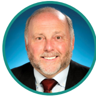
BOB GALE Director